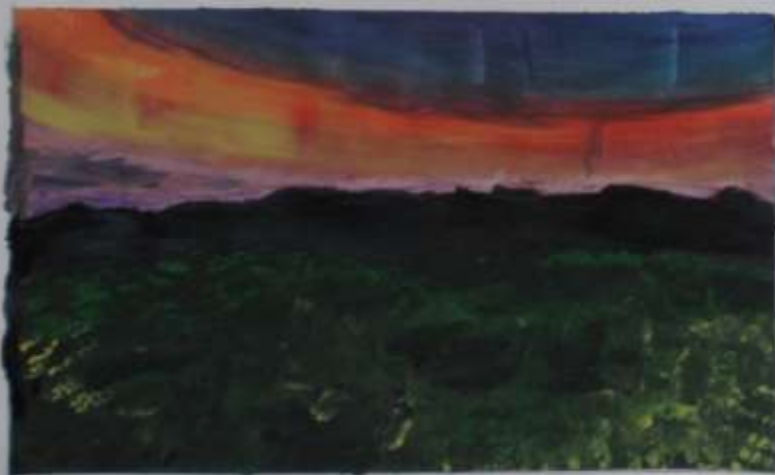
SINISCALCO SARA 3 a B